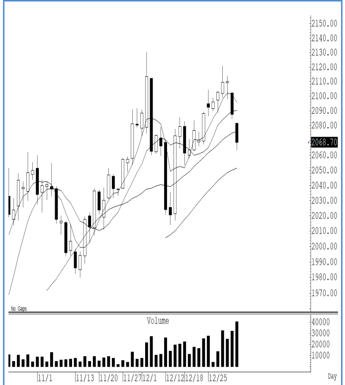
GOH24 (Close 2,068.70 Chg -18.90)

ราคาทองคำโลกย่ำตัวลงต่ำกว่าที่คาด เราแนะนำยกการ์ดสูงหรือตั้ง stop ใว เนื่องจากกำลังปรับขึ้นทดสอบจุดสูงเดิมแนว ๆ 2,130 ดอลลาร์ แนะนำ trading ในกรอบ 2,057-2,080 ดอลลาร์ รั้งรู้กำไร แต่ถ้าในกรณีที่มีปิดต่ำกว่าระดับ 2,050 ดอลลาร์ แนะนำ ถือ short หวังผลปรับตัวลงไปแนว ๆ 2,000 ดอลลาร์ รั้งรู้กำไร